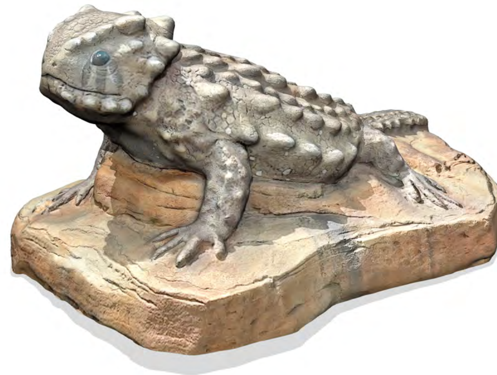
3 Horned Toad_TC049 (Rock Type: Sandstone)