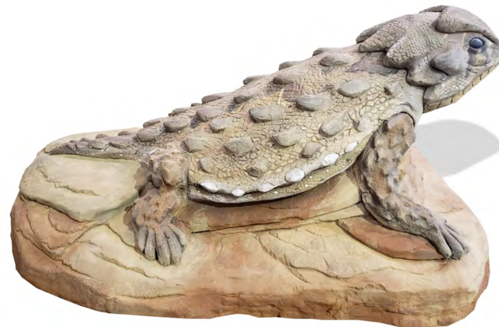
4 Horned Toad_TC049 (Rock Type: Sandstone)